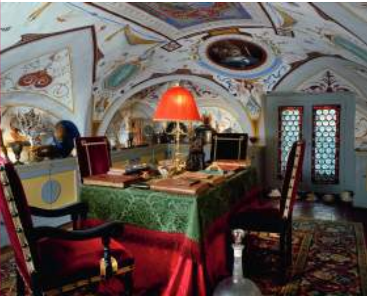
This cabinet of curiosities features grotesque work on the ceiling. acing page : The gym features a neoplastic intervention.