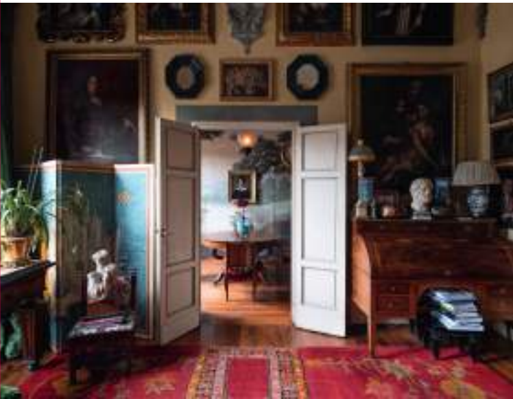
The screen on the left features a sketch of the Empire State Building; on the chair in front of it is a second-century BC Roman sculpture of Bacchus. Above the doorway is a 17th-century work of a rhino, created with shells. On the right is an artwork by Pietro Dandini, a 17th-century Florentine painter; in front of it are two rare German chinoiserie pumpkins from the 18th century. acing page . The library features a collection of first editions of architecture books.