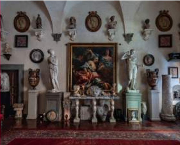
In the centre is an artwork by Baldassare Franceschini, known as Il Volterrano (1611-1689), titled Allegory of Victory and Peace . Under it is a lion head from the first century AD. Flanking the artwork are two neoclassical statues and two Etruscan vases from the fourth century BC. At the top of the wall are medallions of Roman emperors. Facing page: The dining room—the tableware is neo-Etruscan.