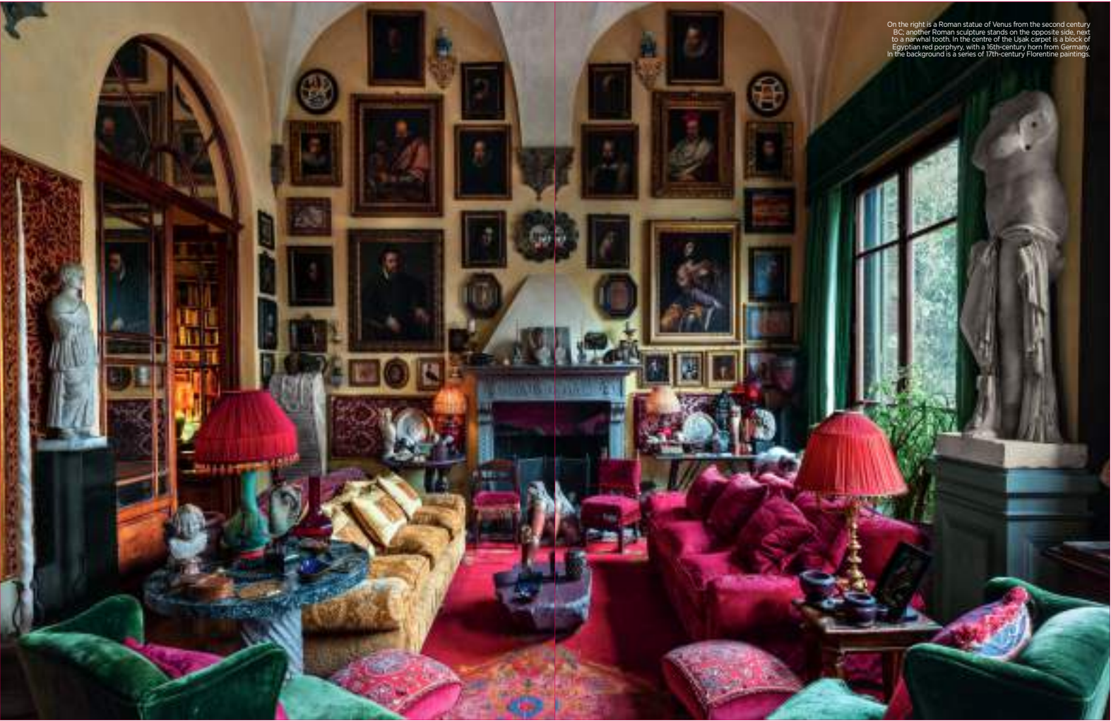
On the right is a Roman statue of Venus from the second century B.C. another Roman sculpture stands on the opposite side, next to a narwhal tooth. In the centre of the Usak carpet is a block of Egyptian red porphyry, with a 18th-century horn from Germany. In the background is a series of 17th-century Florentine paintings.