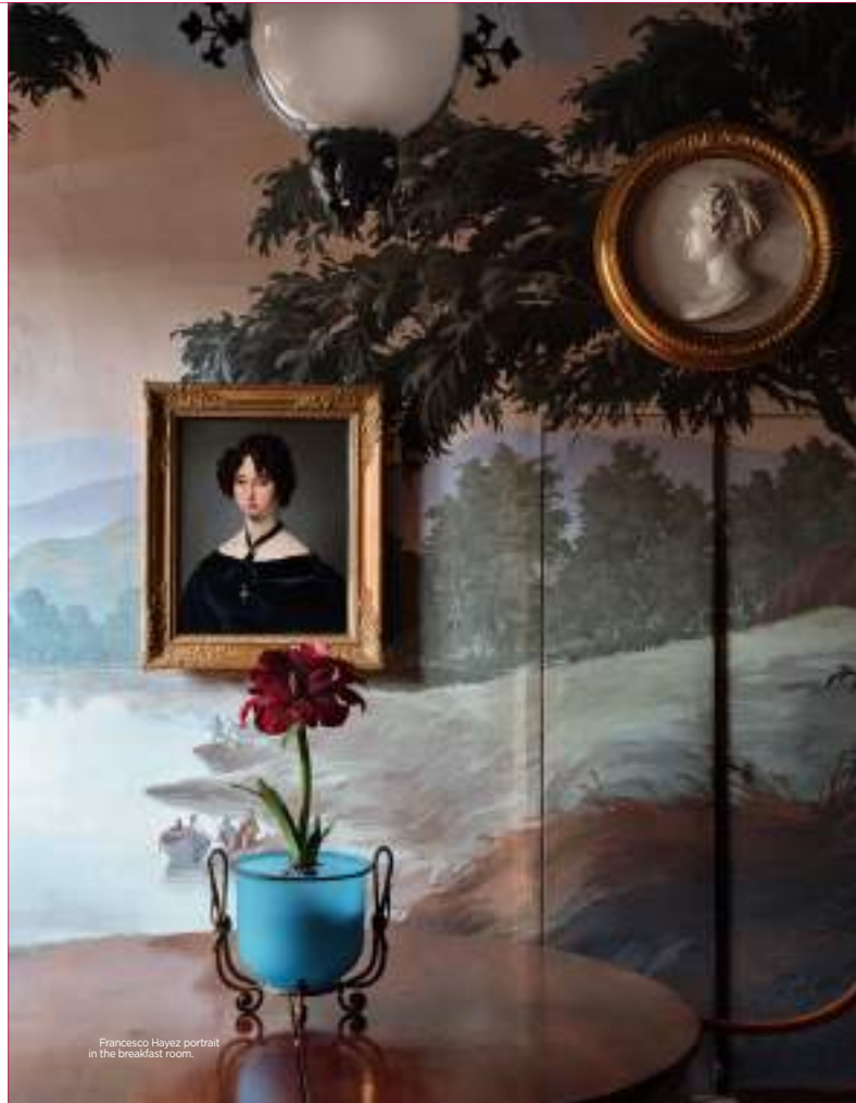
Francesco Hayez portrait in the breakfast room.

THE ITALIAN MASTER, KNOWN FOR HIS LARGE- SCALE IMAGES OF CHURCHES AND PALAZZOS, AND HIS LOVE OF HAND-PAINTED TROMPE L'OEIL, BRINGS HIS WORK HOME. HIS 16TH-CENTURY PALAZZO, IN THE HEART OF FLORENCE, IS TESTAMENT TO ALL THAT HE HAS SEEN